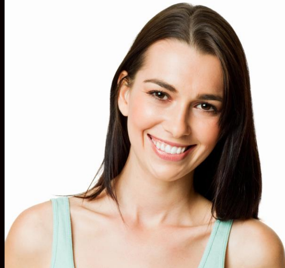
Above: The typical effect of using Playfully Arrogant Humor on a woman.

Real arrogance makes most people hate you, but playful arrogance makes most people really like you. When you use Playfully Arrogant Humor while interacting with women, they feel sexually attracted, excited and lucky to be interacting with a cool guy like you. It's really quite simple to do and when you begin using it in your interactions with women, you will notice that most guys (at least 80%) don't even know about it. They will look on and wonder why women get so excited, happy and attracted in your presence, but they won't be able to work it out.